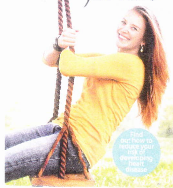
Find out how to reduce your risk of developing heart disease